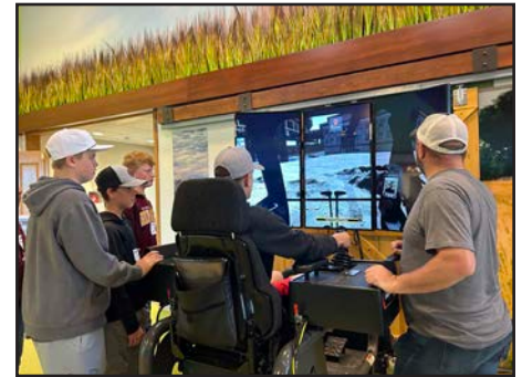
Farmamerica hosts Ag Career Exploration Days. Students pictured are learning how to operate equipment via a simulated experience. This event is supported by WAF grants.