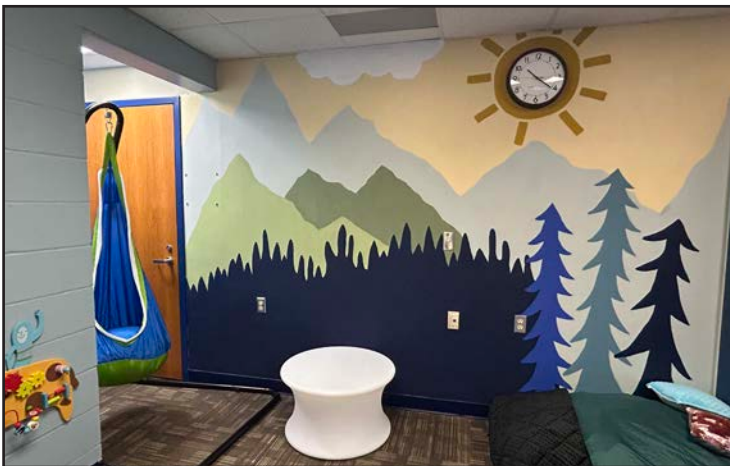
Left: JWP Elementary created a Sensory room with grant dollars from JAF.