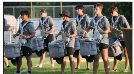
Marching Jays of Waseca were able to participate in a Movement in Music clinic hosted by River City Rhythm. The clinic was made possible with grant dollars from Rosenau Band Fund.