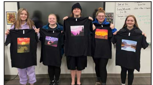
Waseca Jr Sr High Art Class students proudly show off their projects created with a new equipment - color printer and heat press, which were purchased with grant dollars.