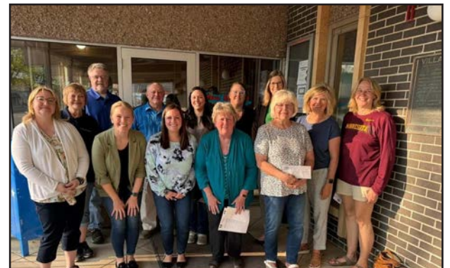
Grant Recipients and NRAF Board members gather to celebrate following the grant awards celebration in New Richland.