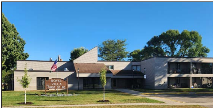
NRAF supported a new landscape project at Royal Villa in New Richland.