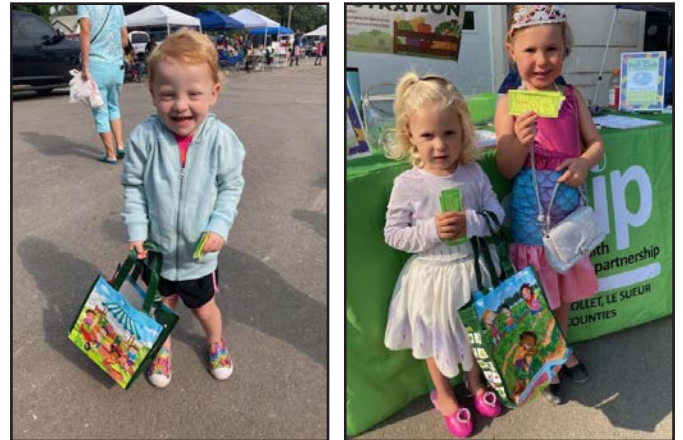
Kids of all ages enjoying shopping at the Farmers Market using PoP Club vouchers to fill their bags with fruits and vegetables.