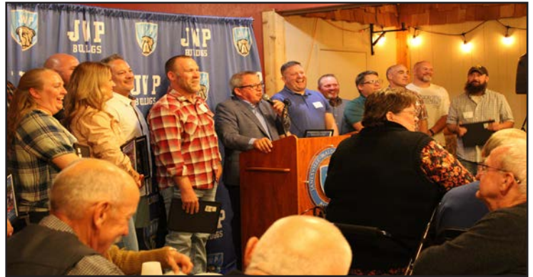
JWP Annual Hall of Fame Banquet is supported by JAF.