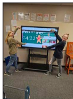
New Richland Schools Interactive Display Panels are multipurpose and can be utilized by so many grade levels. NRAF has purchased many of these for the District in recent years.