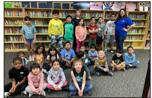
WAF supported the TEAM Academy Math Enrichment Program. Student & staff from TEAM pictured here.