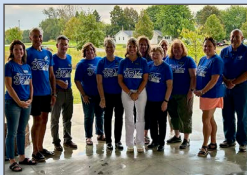
Waseca Area Foundation board members gather at the 35th Anniversary party in September 2024.